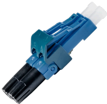
Clip installation on SSF-LC-SMUPC Single-mode connectors. Connectors sold separately.